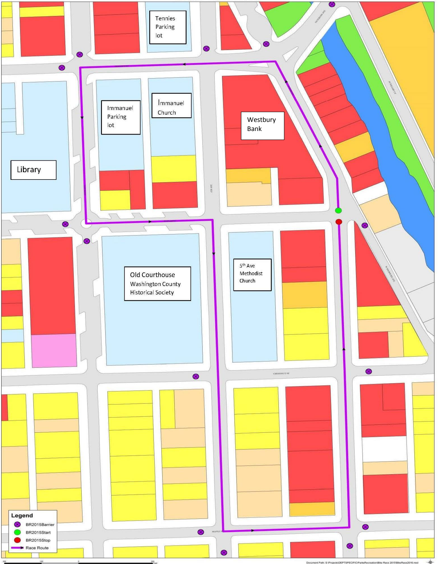
MAP #1 (Purple Lines= Race Course Purple Circles = Race course barricades Red & Green Dots= Start/Finish line)